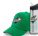
MASTER BLASTERS KIT